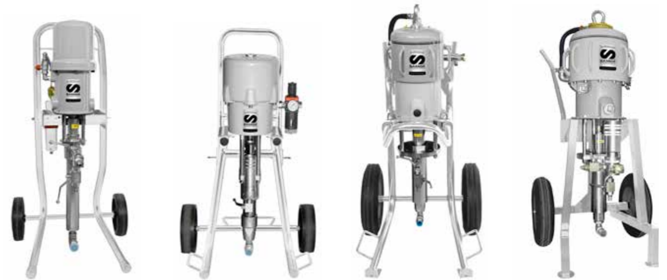
GHIBLI wash pump

4 1/2" effective air motor diameter. 10:1 pressure ratio.